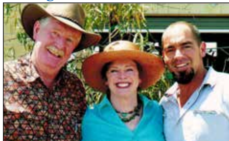
Ahlem Farms Partnership