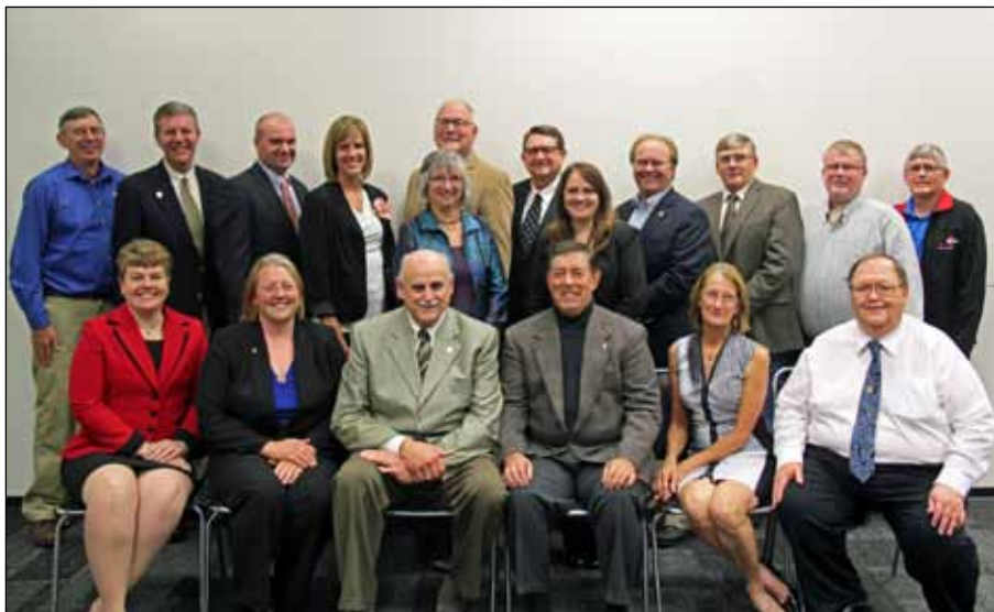
The 2014-15 Board of Directors