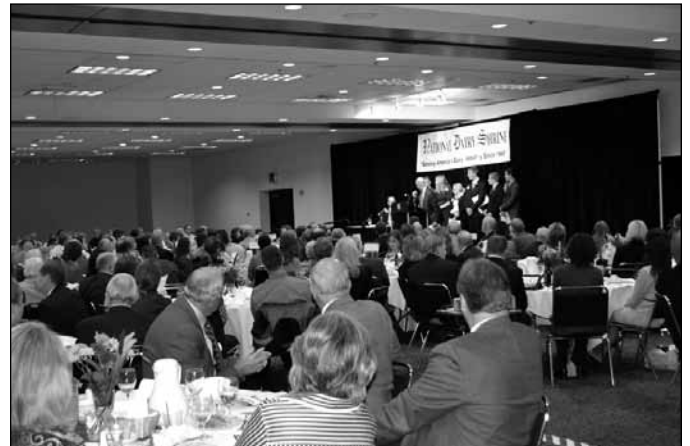
The Banquet Hall