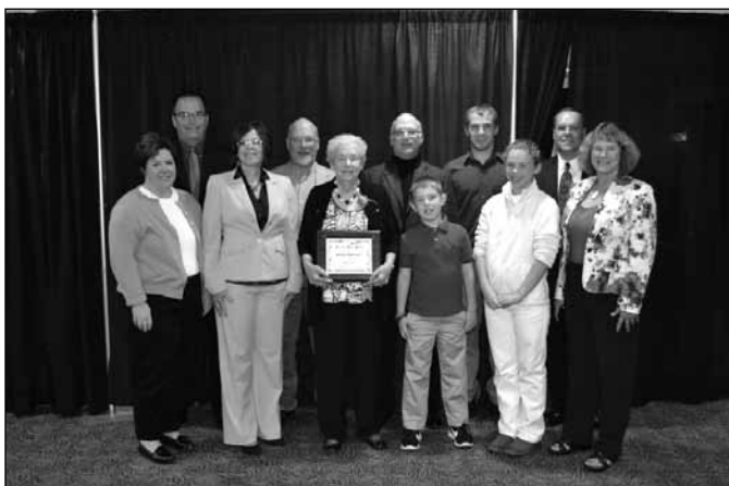
Pioneer Recipient - Opperman Family