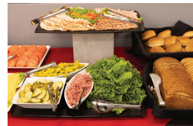
Young people had the chance to interact with their peers and network with industry representatives during the luncheon.