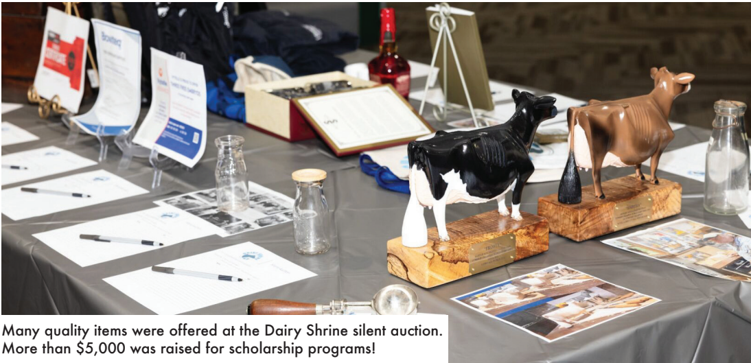
Many quality items were offered at the Dairy Shrine silent auction. More than $5,000 was raised for scholarship programs!