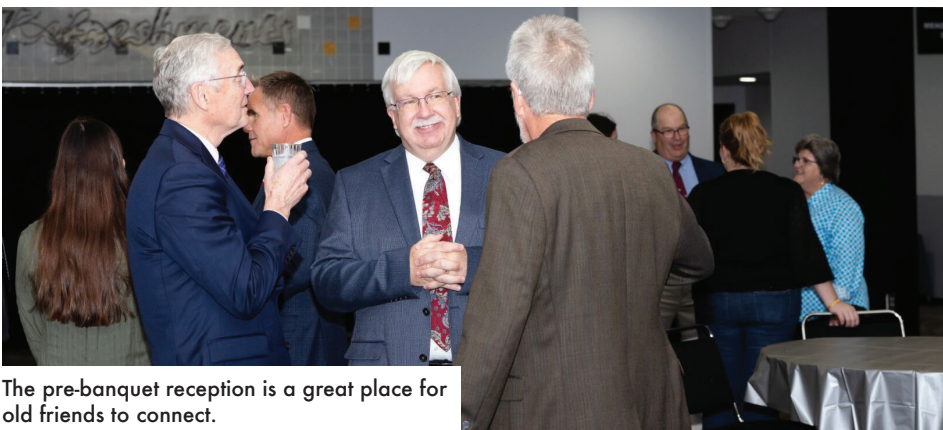
The pre-banquet reception is a great place for old friends to connect.