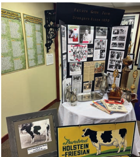
A display highlights Future Hope Holsteins, a prominent dairy farm located near Fort Atkinson, Wisconsin.