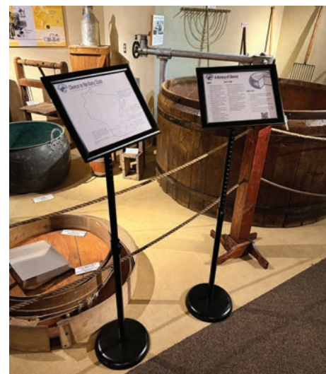
Part of the cheese display includes signage with a brief history of cheese making and a QR code that takes users to videos on cheese production.