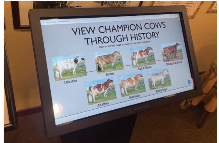
A new digital display includes champion cows dating back to as early as 1906.