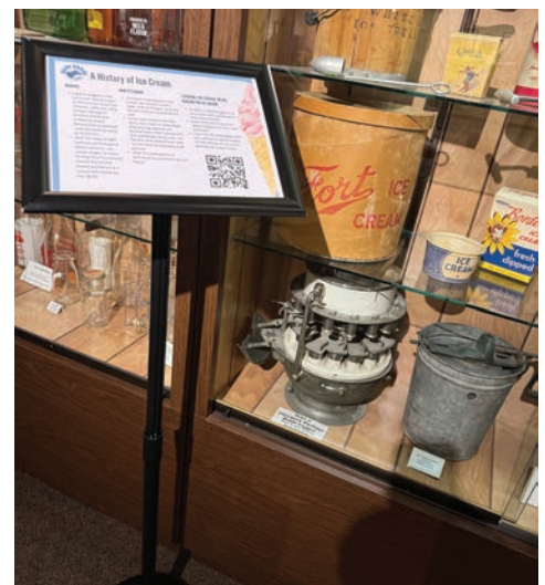
In the ice cream area a sign provides a background on ice cream making plus a link to videos on how ice cream is made.