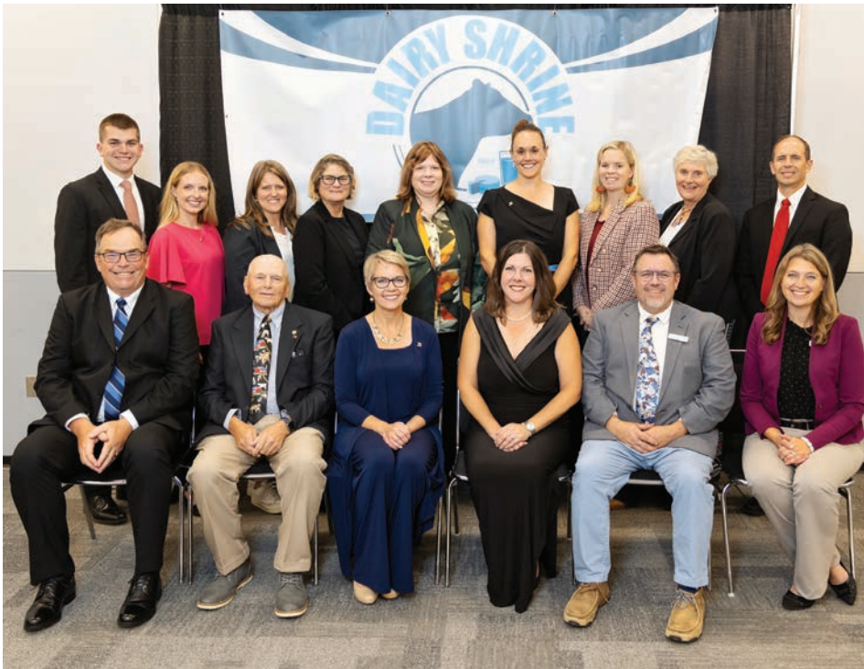
The current National Dairy Shrine board of directors.