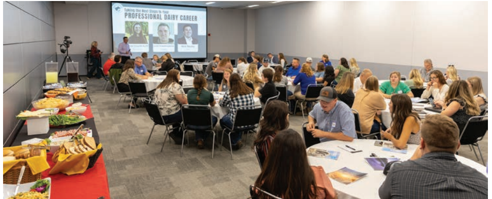
Nearly 100 young people and industry supporters attend the Young Professionals luncheon.

The National Dairy Shrine remains a cornerstone of our organization. While