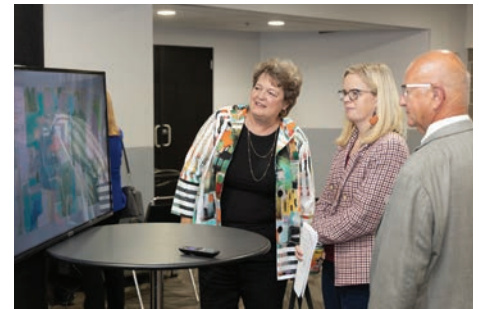
Dairy Shrine enthusiasts admired displays during the awards banquet reception.