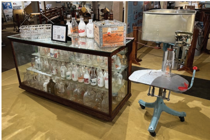
A milk bottle display greets visitors as they enter the Dairy Shrine exhibit.

The museum is open Tuesdays through Saturdays from 9 am to 4 pm and is free to the public. ●