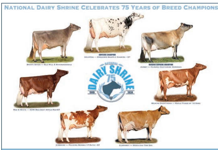
To celebrate the great cows of the past 75 years, an online judging contest was held that identified great cows of each breed. Champions from each decade going back to the 1950s made up the judging classes. Thousands of people went online to vote for their favorite cows. Winning Supreme Champion was Erbacres Snapple Shakira.