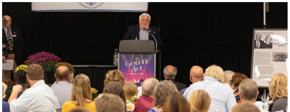
Award winners were lauded at the 2024 National Dairy Shrine awards banquet.

educational opportunities abound inside the museum, we are actively working to enhance the visitor experience. We will be working with a museum consultant to develop a plan for upgrading the historical displays. We will also be pursuing opportunities to upgrade the digital capabilities inside the museum to enhance the learning experience.